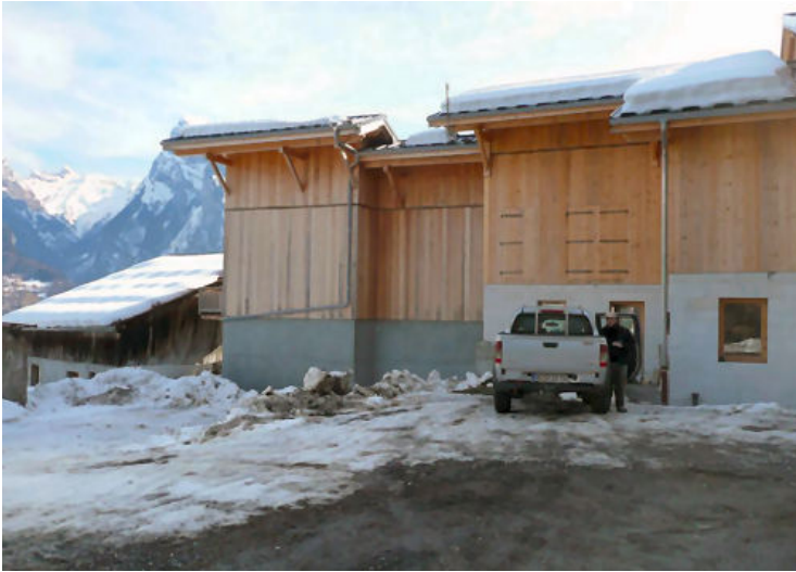
The building would be attached to the left of the pickup