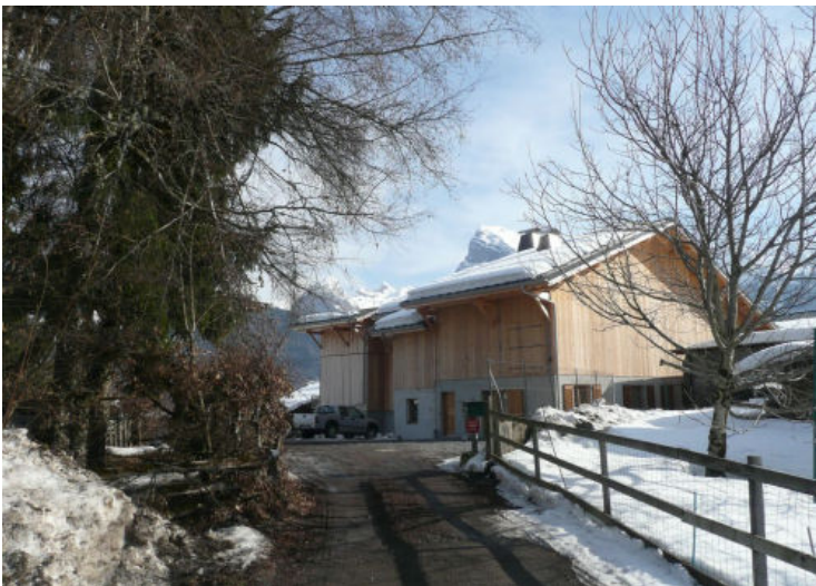
The access road