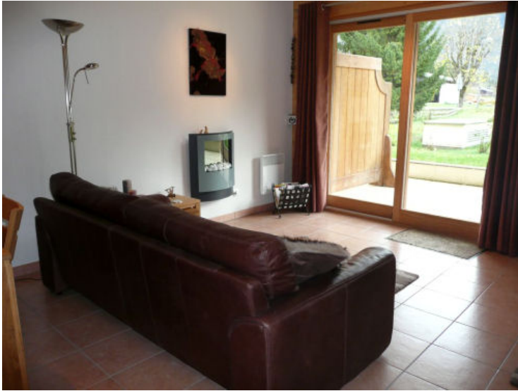
The living room