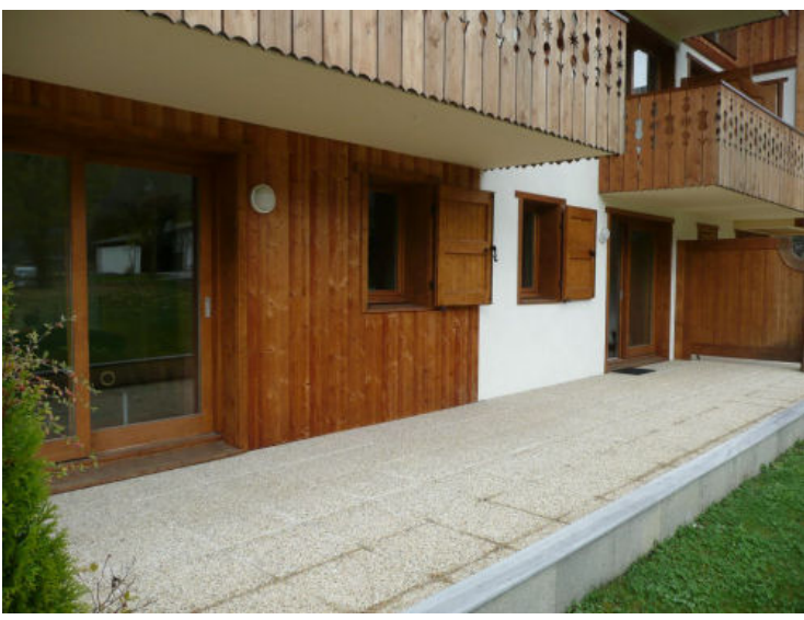
Large terrace area