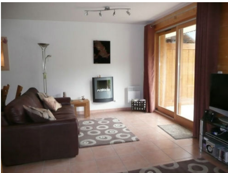
Patio doors to the terrace