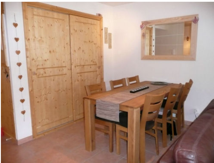
The dining area